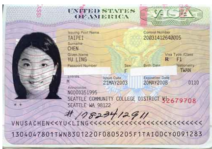
Sample F-1 visa